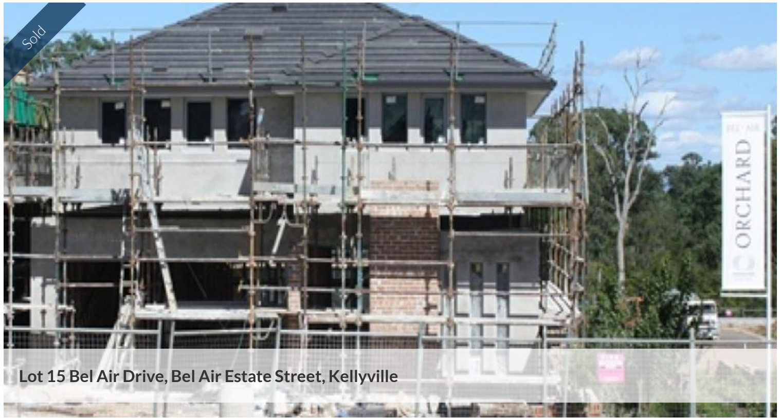
Lot 15 Bel Air Drive, Bel Air Estate Street, Kellyville